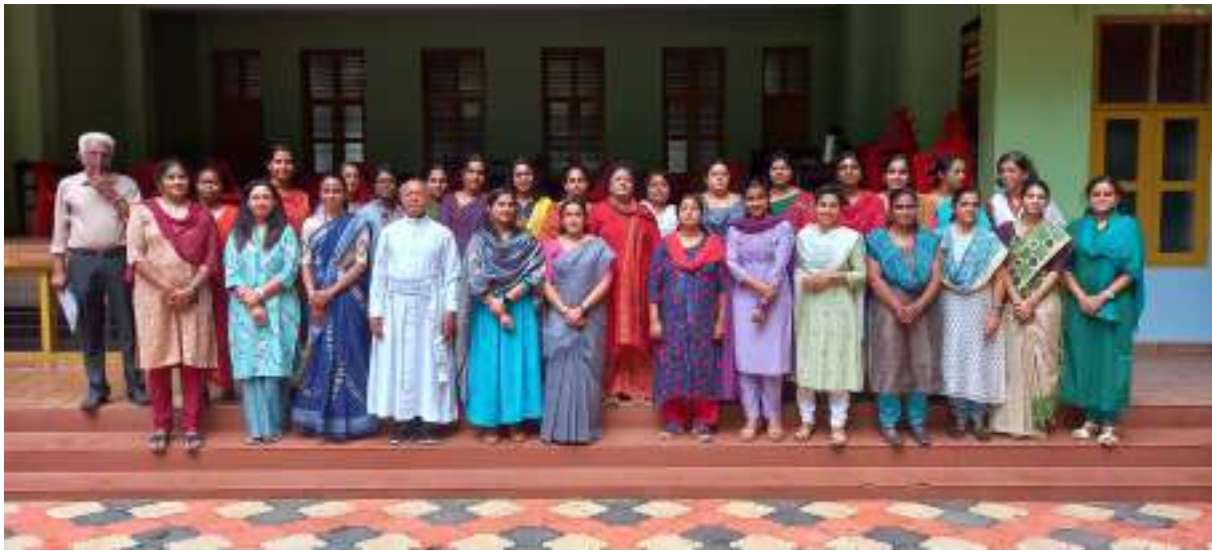
Special PHONETICS TRAINING SESSION for the staff, on 20 May 2022