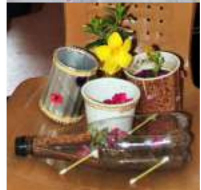
THIRD PRIZE (JUNIORS): STD VI C