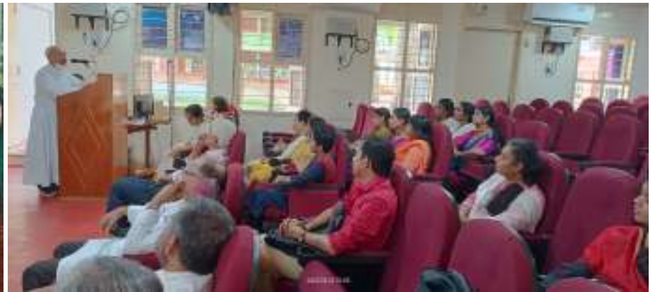
ORIENTATION SESSION for new teachers: 23 May 2022