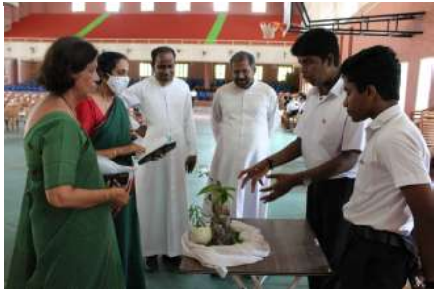
SECOND PRIZE (SENIORS): STD IX C