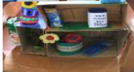
THIRD PRIZE (JUNIORS): STD VI D