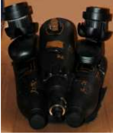
SECOND PRIZE (JUNIORS): STD VII A