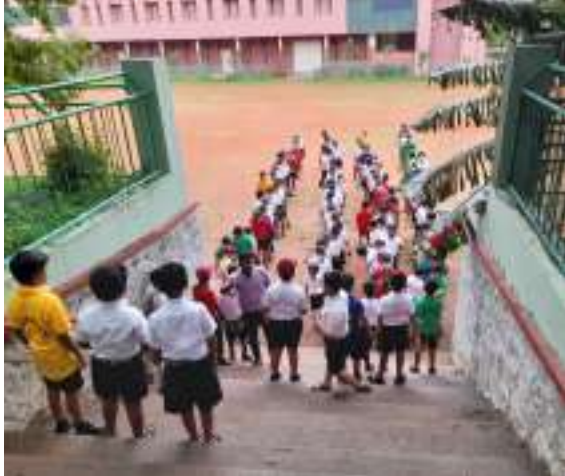
Junior boys getting ready for the warm-up before the games begin