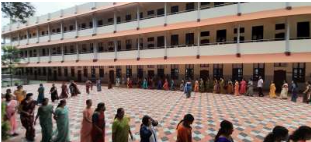
A lighter moment during the staff orientation session: Breaking the non-existent ice!