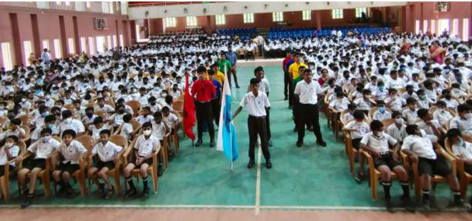
Prelude to the transfer of responsibilities