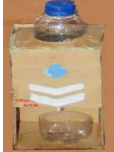
SECOND PRIZE (JUNIORS): STD VII C