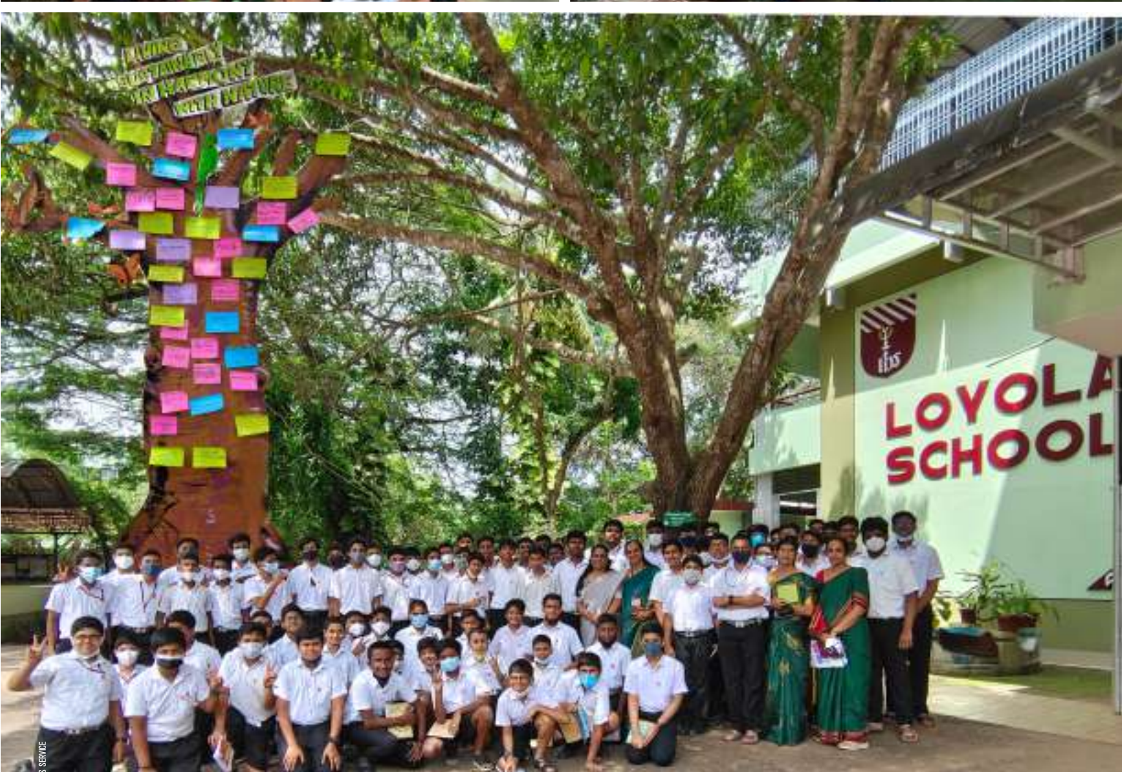
Spiritual cousins of Sunderlal Bahuguna, Vandana Shiva and their ilk, in the shade of the freshly-labelled bullet wood tree. Seen in the background is the cluster of taglines appropriate for the Environment Day observance