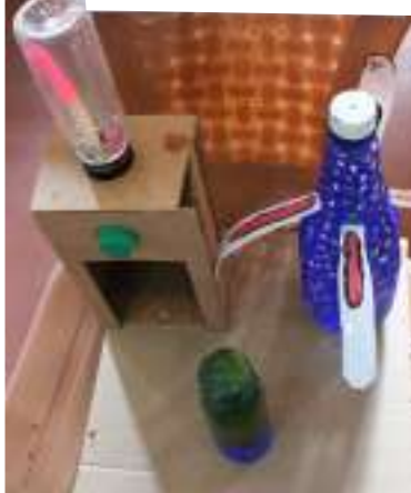
FIRST PRIZE (JUNIORS): STD VI A