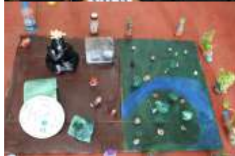
FIRST PRIZE (JUNIORS): STD VII D