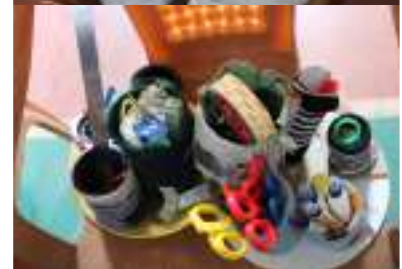
SECOND PRIZE (JUNIORS): STD V D