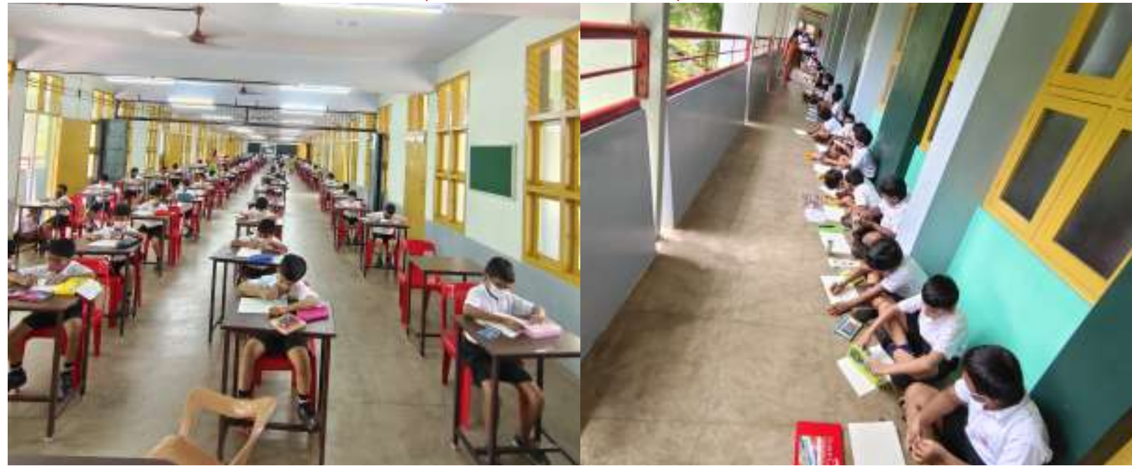
Berchmans Hall brimming with participants of Environment Day Drawing and Painting Competitions