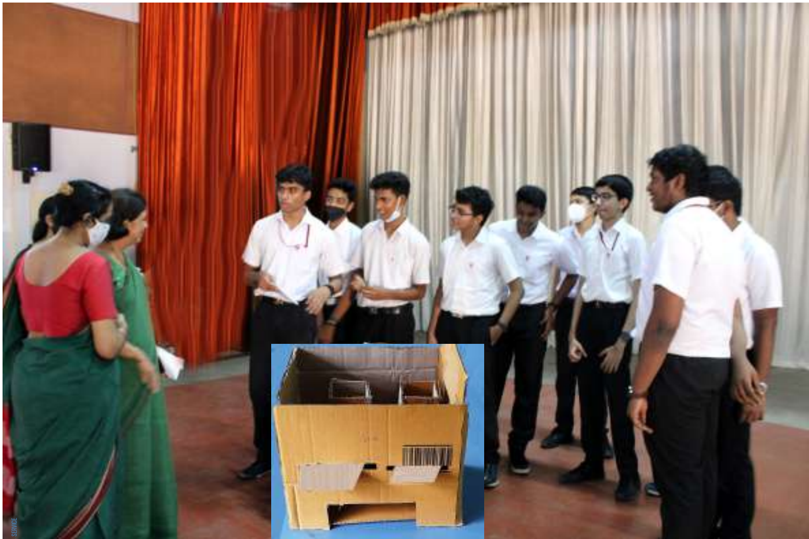
The boys of XI B, the winners of the FIRST PRIZE (SENIORS) , explaining the working principles of their creation, christened 'LOYOLA ATM'